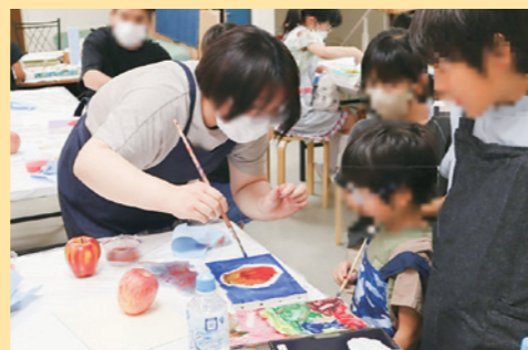
The organization of "Machi-Zemi" seminars

We support the development of an attractive community and the promotion of local culture by backing commercial, industrial, and tourism-related activities, as well as various events.