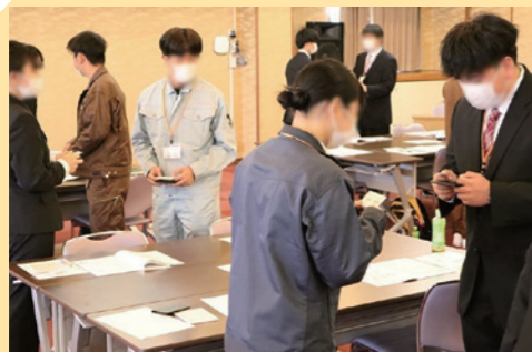
New Employee Training Program

We offer comprehensive support for your business through over 50 different services focused on "business management support," "cost reduction," and "networking".