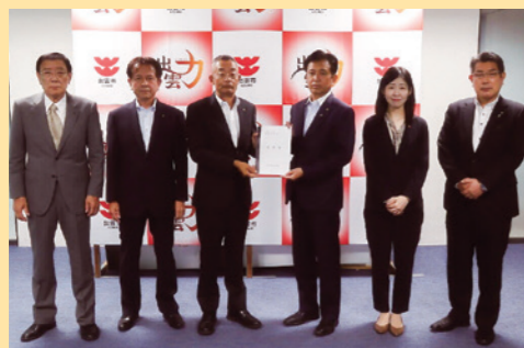
Submitting requests to the City of Izumo

We gather the voices of our member companies and actively advocate to the government and political entities, not only on behalf of our members but for all small and medium-sized enterprises, to ensure they can maintain their vitality and operate smoothly.